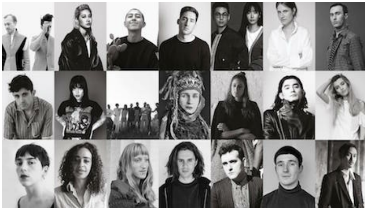
Portraits of the LVMH Prize 2017 candidates