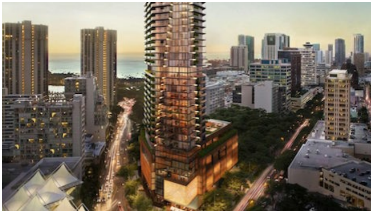
Mandarin Oriental, Honolulu at Mana`olana Place, computer rendering