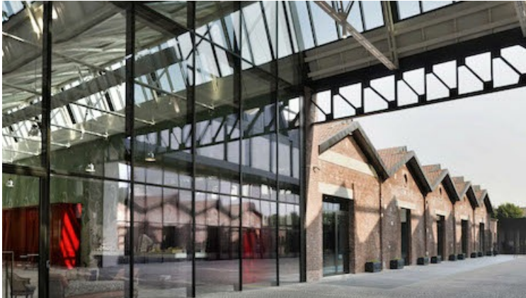
Exterior of Gucci Hub