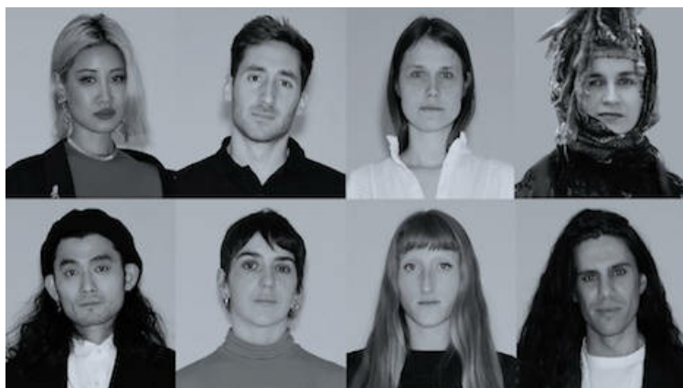
2017 LVMH Prize finalists