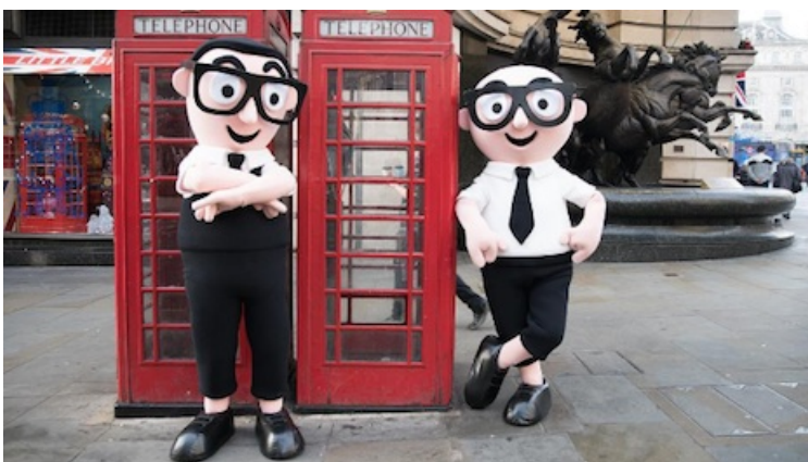
Dolce & Gabbana's mascots in London

Since the vote, some industries have struggled, while others have boomed.