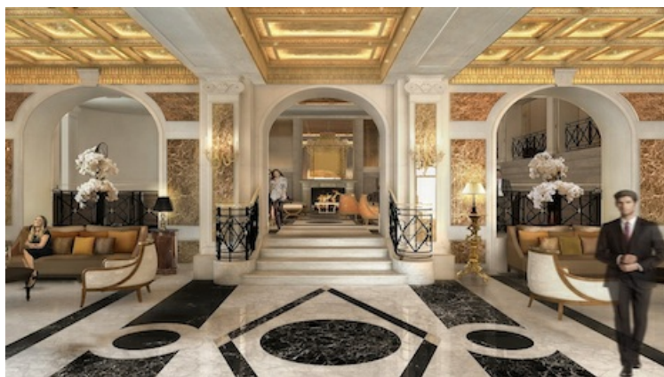
Rendering of Dorchester's Hotel Eden in Rome