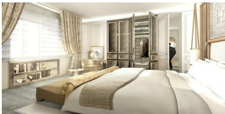
Rendering of Hotel Eden guest room

The Dorchester Collection planned to smooth the transition process for guests by working closely with Starwood Hotels & Resorts, which is the current managing company ( see story ).