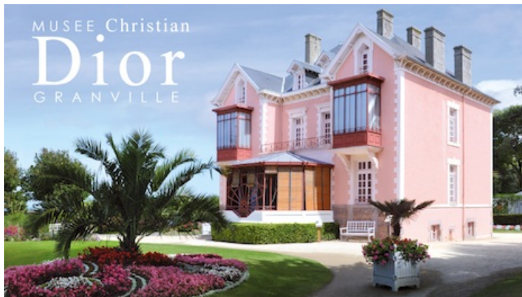
Christian Dior Museum in Granville, Normandy, France