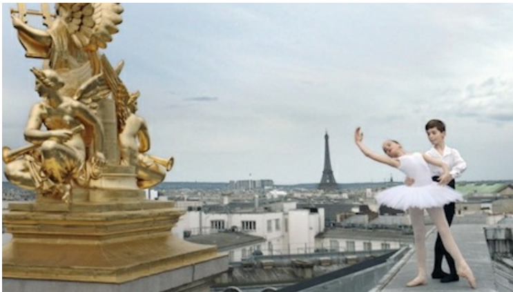
Fear of terrorist attacks can be an obstacle for tourism. Still from Paris' tourism film by Jalil Lespert