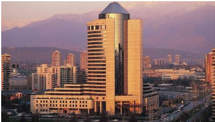
Mandarin Oriental's soon-to-be Hotel Santiago