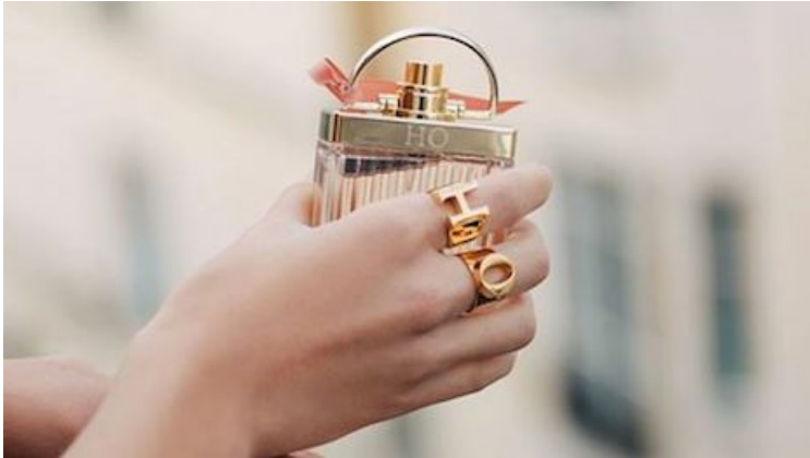
Chlo Love Story Eau Sensuelle fragrance