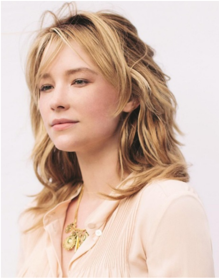
Haley Bennett for Chlo fragrances

Ms. Bennett took to her personal Instagram to let her fans in on the news, sharing a portrait of herself dressed in a light pink Chlo blouse. In the two posts following, Ms. Bennett took time to stage photographs of Chlo fragrance bottles in different scenarios.