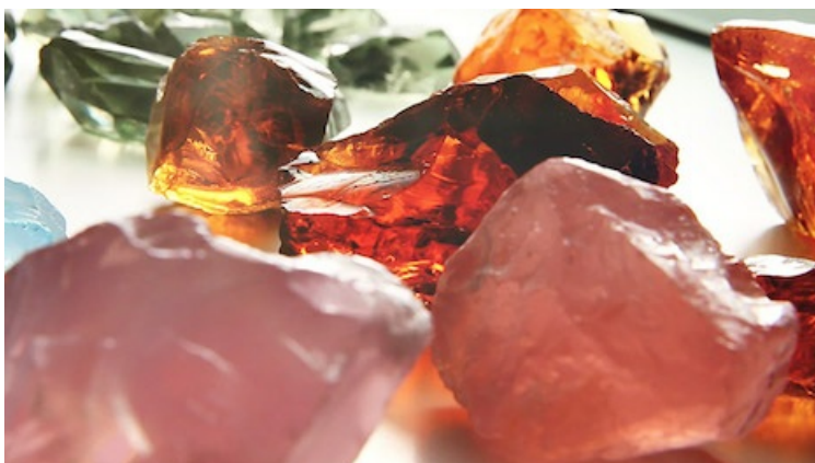
Gems and precious stones used in Pomellato jewelry.

EVEN IF conglomerates seem to be a route with no return, there always has to be room for the family-owned businesses to shine as this is really the part of the luxury industry that best creates the myth and the mystery of true