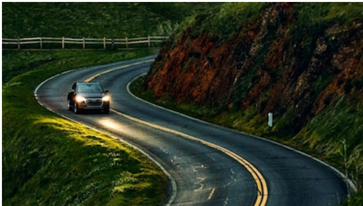
Audi Q5 driving on a mountain road