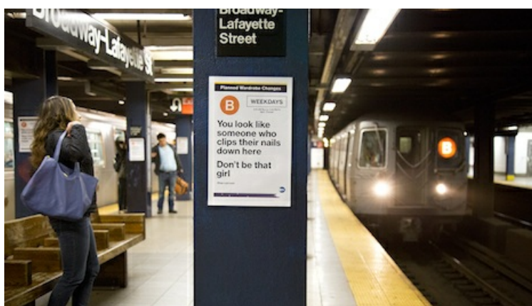
Lyst's ads mimicked the MTA's service advisories.

Lyst disguised a subway ad campaign by modeling ads after service notifications, connecting with consumers over shared commuting frustrations ( see story ).