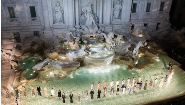
Fendi runway show at the Trevi Fountain celebrating the house's 90th anniversary.