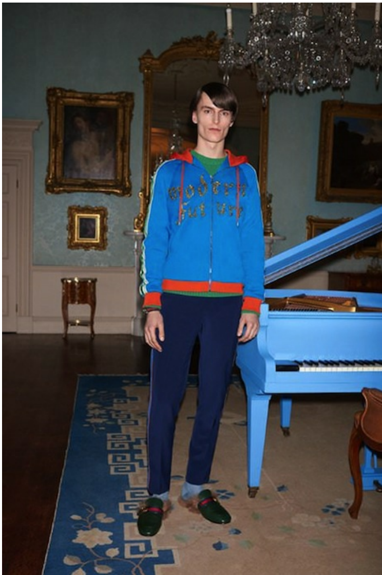
Gucci's collaboration with Mr Porter.

Also, Gucci has branched out to work with a number of retailers, including the popular Mr Porter platform for a 43-piece capsule collection accompanied by an experimental short film ( see story ).