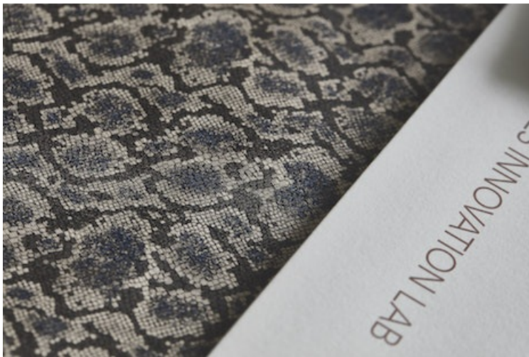
Kering's Innovation Lab is focused on sustainability.

For example, Kering is working to educate future members of the luxury business in methods on meeting their own sustainable goals through an educational partnership and course with New York's Parsons School of Design.