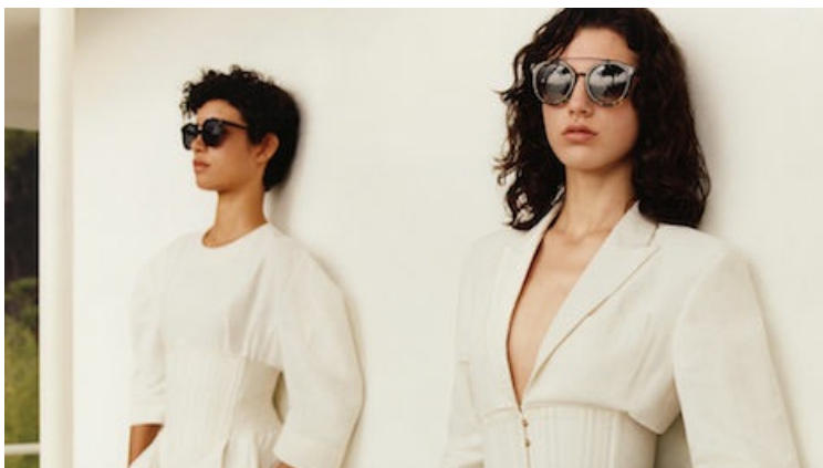
Stella McCartney eyewear.

"Not only [is Kering] taking care of the environment, but also their clients and their employees. It is a seamless approach to taking care of people."