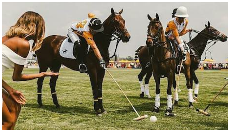
Veuve Clicquot Polo Classic 2017.

Lexus has a similar longstanding role with the U.S. Open Championship, with the automaker setting up a stand complete with photo-taking opportunities, meet-and-greets and the chance to try their hand on a golf simulator at the most recent tournament ( see story ).