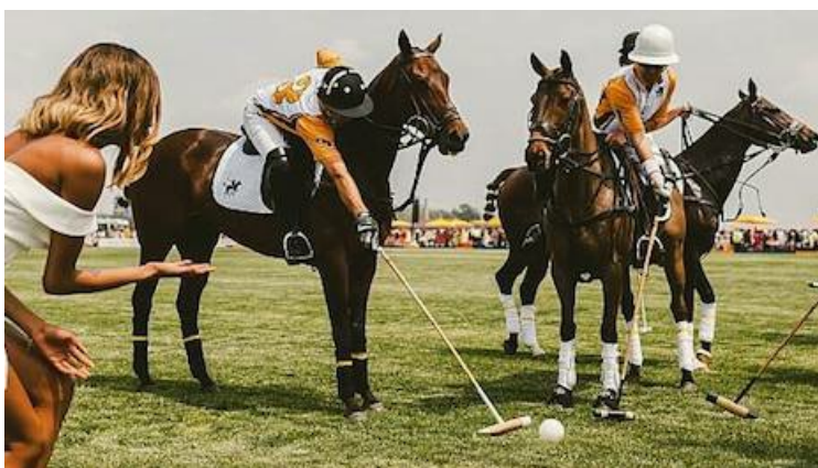
Veuve Clicquot Polo Classic 2017.

Lexus has a similar longstanding role with the U.S. Open Championship, with the automaker setting up a stand complete with photo-taking opportunities, meet-and-greets and the chance to try their hand on a golf simulator at the most recent tournament ( see story ).