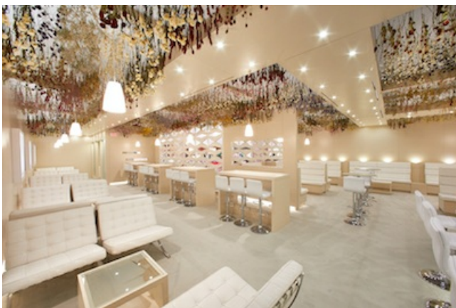
NetJets' Art Basel Miami lounge.

Art Basel's Hong Kong, Miami and Basel, Switzerland iterations have brought out partners such as Audemars Piguet, La Prairie and BMW. These brands show fairgoers and VIPs hospitality through artistic installations or shuttle services.