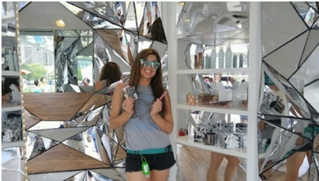
Nordstrom's pods at South by Southwest.

Vying for the millennial audience, Tag Heuer sponsored the Coachella Valley Music & Arts Festival in 2016, while Nordstrom launched a series of pop-up experiences in portable pods at a number of music festivals the same year. The retailer's pods included a screen-printing station, a "dream closet" and a beauty bar, bringing the store to these events ( see story ).