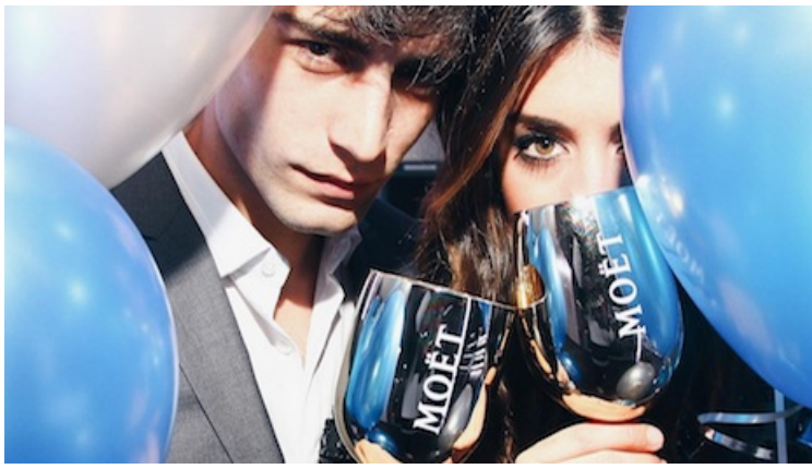
Celebrate Mot Moments.

Social media has also become a means for brands to build a guest list for an event, such as Domaine Chandon's Instagram invite-only affair that asked its Instagram community to follow a link to get on the list ( see story ).