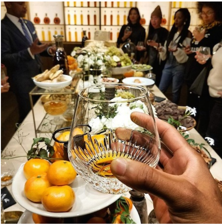
La Maison Rmy Martin.

Likewise, Cartier took over French-Vietnamese restaurant Indochine for a weekend-long pop-up for its Panthre timepiece. For the duration of the millennial-focused event, there were photo experiences, social media activations, DJ performances and an appearance by Olivia Culpo ( see story ).