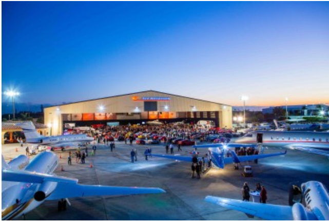
Shamin Abas PR produced La Bella Machina event for Jet Aviation.

According to a panel discussion at Luxury FirstLook: Strategy 2017, the guest list is often one of the most challenging aspects of throwing an event ( see story ).