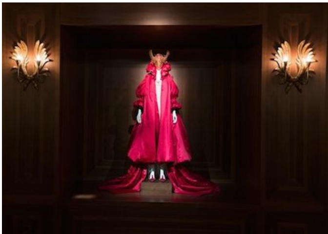
Alexander McQueen: Savage Beauty exhibition at the Victoria and Albert Museum, London.

Similarly showing the strong interest in exhibits, "Alexander McQueen: Savage Beauty" broke previously held records for attendance when it was staged at the Metropolitan Museum of Art's Costume Institute in 2011. When it traveled to the late designer's home base of London at the Victoria & Albert Museum, it was the most-visited exhibit in the city that year ( see story ).