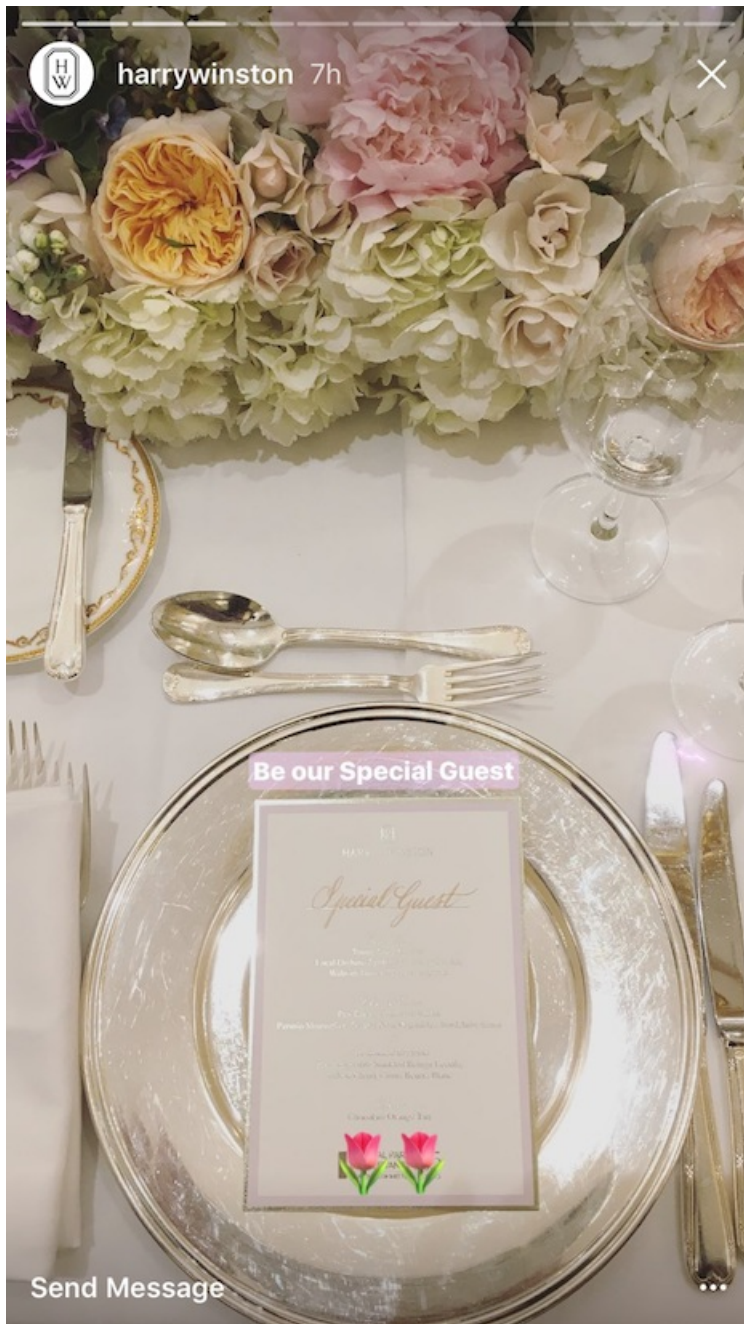
Harry Winston Instagram Story.

For instance, these capabilities have become widely used by fashion labels looking to allow an unlimited number of viewers see their fashion shows. Snapchat was also tapped by Hublot to invite the public to a corporate event, sharing the official opening of its second manufacturing facility ( see story ).