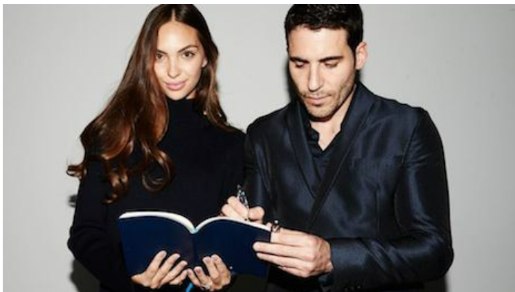
Model Natalie Vertiz and actor Miguel Angel Silvestres for Montblanc's #PassItOn campaign.