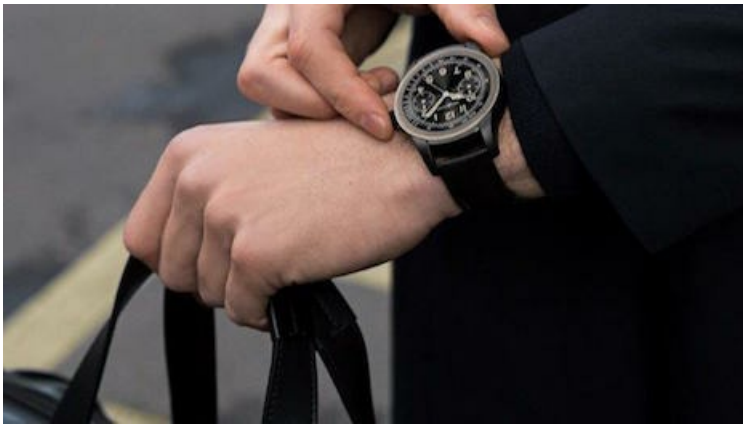
The Montblanc Summit smartwatch.

new and innovating experiences such as WeChat, it could make a big difference for the overall group. Another major step forward for the conglomerate is the release of the Montblanc Android Wear watch.