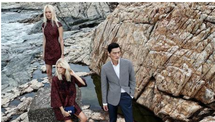
Shanghai Tang was founded as a modern Chinese luxury label.

Richemont also sold Chinese luxury label Shanghai Tang to Italian entrepreneur Alessandro Bastagli.