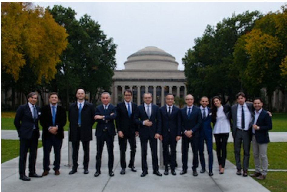
Lamborghini's team at MIT in Cambridge, MA.

Italian automaker Lamborghini, for one, works with the Massachusetts Institute of Technology (MIT) on research initiatives, with the end goal of establishing a super sports car that is ready for the rest of the 21st century.