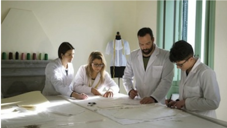
Fendi students at The Massoli Academy.

Fendi, for example, has worked closely with Sartoria Massoli, an Italian couture workshop, since 1982. The Massoli Academy, based out of the Sartoria Massoli, is endorsed by Fendi via a course designed to teach the savoir-faire of dressmaking to a new generation ( see story ).