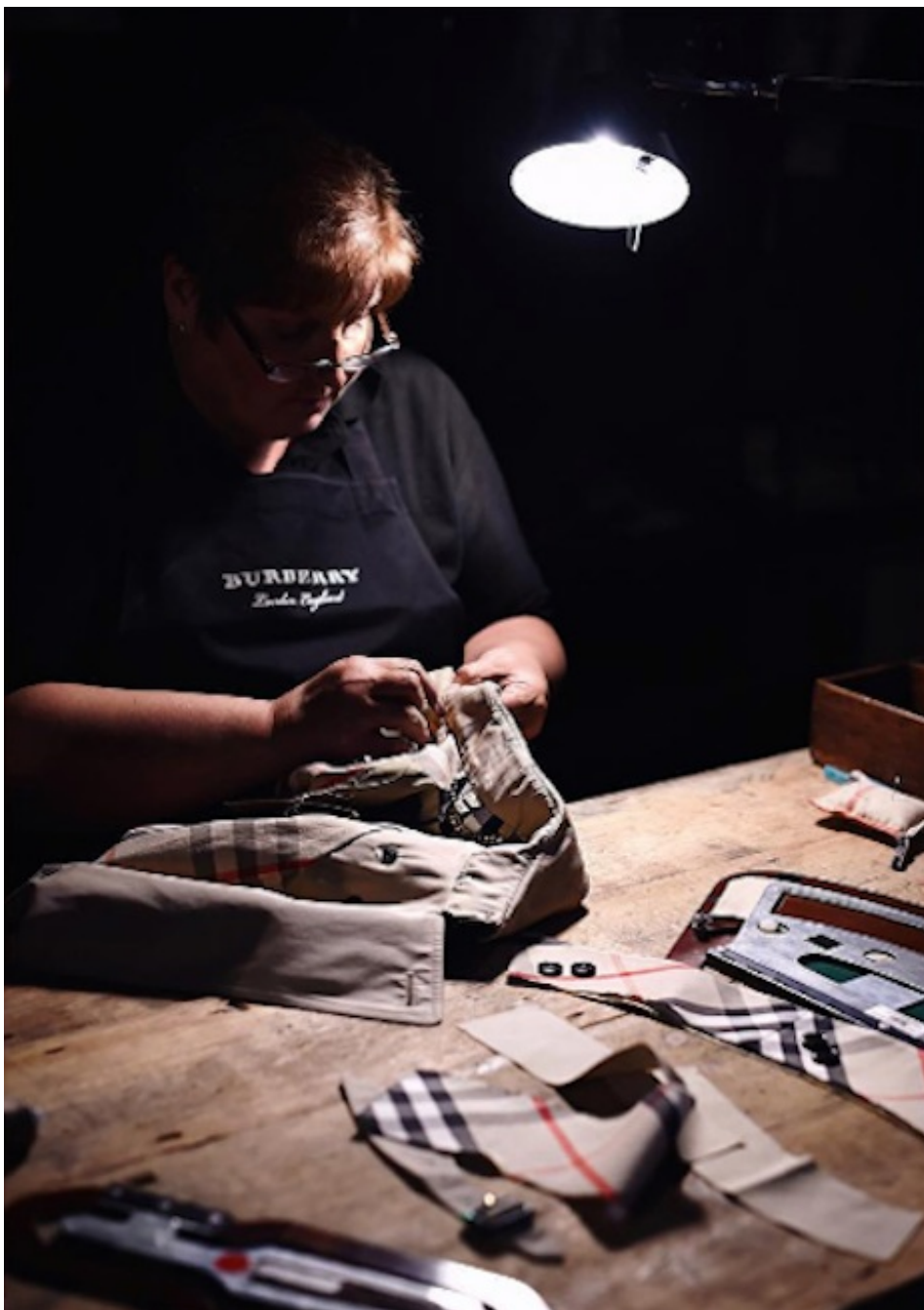
A Burberry artisan constructing a trench coat.

In June, Burberry announced it had gifted $3.8 million to the Royal College Art in London to spur materials science innovation. Through its Royal College of Art grant, the Burberry Material Futures Research Group will be the first science, technology, engineering, art and mathematics (STEAM) research center at an art and design university.