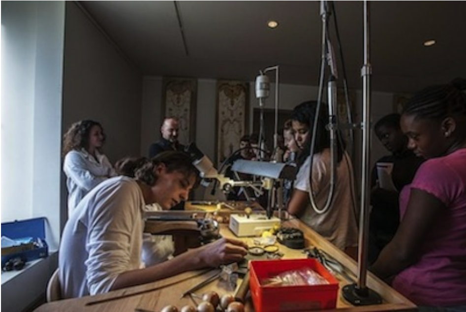
French middle schoolers attending Comité Colbert's Career Day 2014.

Together with French Ministry of Education, Comité Colbert hosts hands-on experiences days at the Musée des Arts décoratifs in Paris. The 2015 edition saw 700 middle schoolers invited to experience what the luxury business has to offer to ensure that the crafts behind many goods remain for future generations ( see story ).