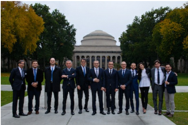
Lamborghini's team at MIT in Cambridge, MA.

Italian automaker Lamborghini, for one, works with the Massachusetts Institute of Technology (MIT) on research initiatives, with the end goal of establishing a super sports car that is ready for the rest of the 21st century.