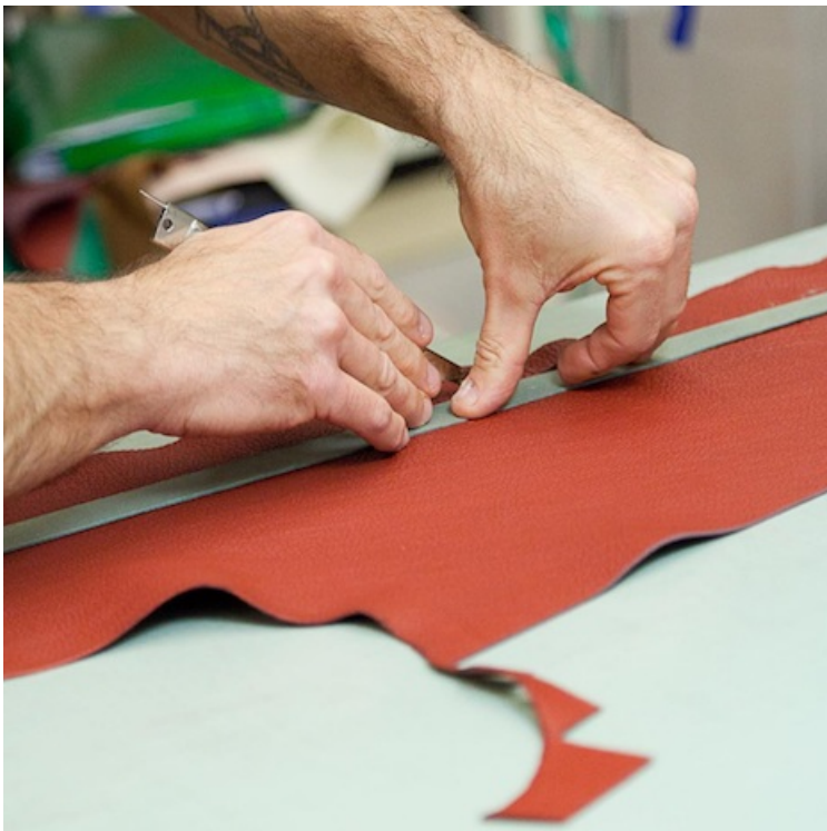
A Berluti shoemaker at work.

The role of creative director was identified as the the most difficult role to fill, with 67 percent saying finding talent to assume the duties was a struggle. This was followed by brand director, designer and pattern-maker.