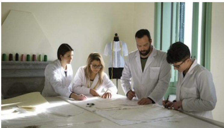
Fendi students at The Massoli Academy.

Fendi, for example, has worked closely with Sartoria Massoli, an Italian couture workshop, since 1982. The Massoli Academy, based out of the Sartoria Massoli, is endorsed by Fendi via a course designed to teach the savoir-faire of dressmaking to a new generation ( see story ).