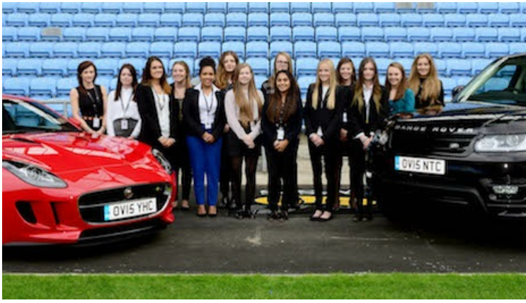
Jaguar's next class of Women in the Know students.

The luxury hospitality industry is not immune from the perceived talent drought either, with fewer individuals opting for managerial or service positions, as they are no longer viewed as long-term career options.