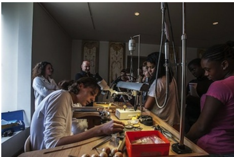
French middle schoolers attending Comit Colbert's Career Day 2014.

Together with French Ministry of Education, Comit Colbert hosts hands-on experiences days at the Muse des Arts dcoratifs in Paris. The 2015 edition saw 700 middle schoolers invited to experience what the luxury business has to offer to ensure that the crafts behind many goods remain for future generations ( see story ).