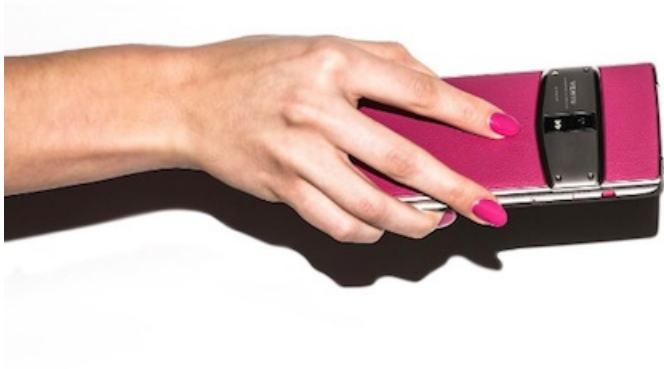
Vertu Constellation phone.