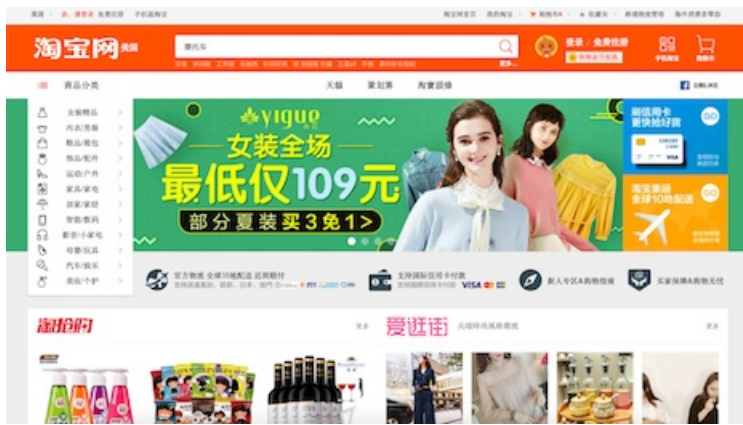
Taobao's homepage.

In the 12 months ended in August 2016, Alibaba Group said it closed 180,000 shops on its Taobao platform and removed more than 380 million listings for counterfeit items. The platform, which is similar to eBay and is a top ecommerce platform for Chinese consumers, has put measures in place to try to prevent offender sellers from reopening.