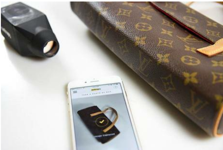
Entrupy system.

Startup Entrupy sells secondhand dealers a device that hooks into a smartphone. Using this attachment, the user scans a handbag and sends the resulting images to Entrupy.