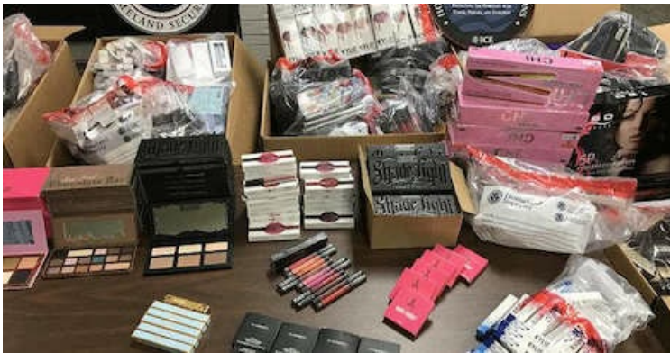
Counterfeit cosmetics seized in the U.S. that were imported from Asia.

China is the top producer of counterfeit goods. Almost two-thirds of all fake items seized in 2013 came from the emerging market.