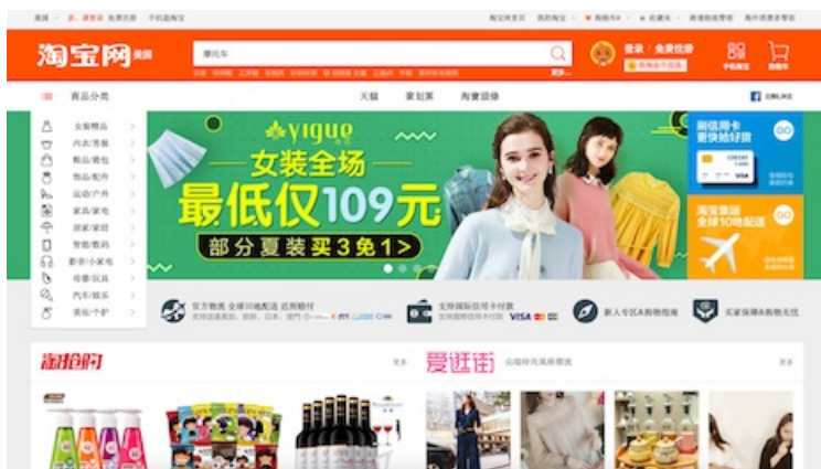
Taobao's homepage.

In the 12 months ended in August 2016, Alibaba Group said it closed 180,000 shops on its Taobao platform and removed more than 380 million listings for counterfeit items. The platform, which is similar to eBay and is a top ecommerce platform for Chinese consumers, has put measures in place to try to prevent offender sellers from reopening.