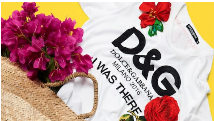
Dolce & Gabbana #DGTheRealFake tee leans into the skid.

Some have even made light of counterfeiting, with Dolce & Gabbana producing a series of authentic touristy T-shirts inspired by ones sold by street vendors alongside the label's alta moda event in 2016. The #DGTheRealFake shirts, which were revealed at the brand's spring/summer 2017 fashion show, had a lofty price tag ( see story ).