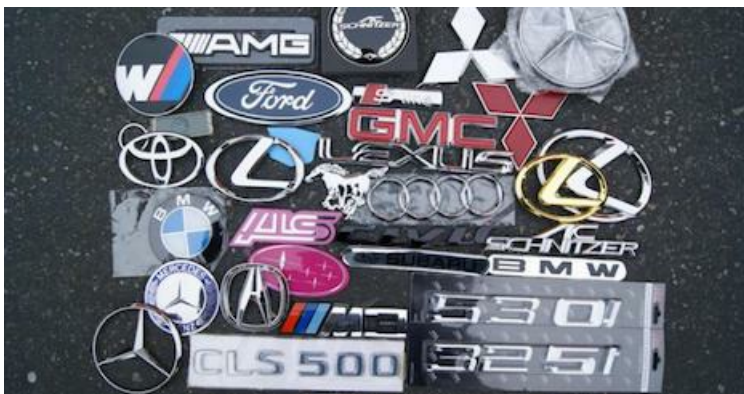
Fake auto accessories seized in Seattle.

Counterfeiters have been caught making fake auto parts as well as accessories. The parts not only hurt the auto industry, but can also be dangerous.