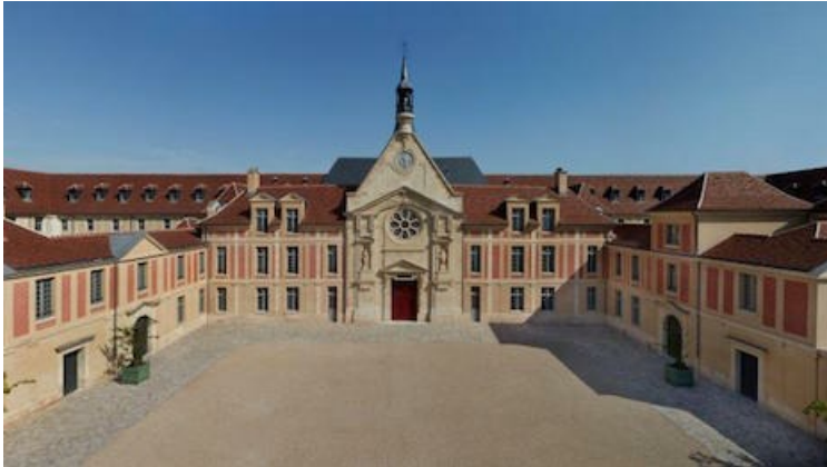
Kering's headquarters at 40 rue de Svres in Paris.