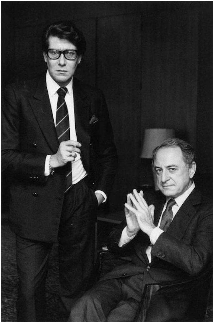
Yves Saint Laurent with Pierre Berg.

The businessman was behind the creation of two new museums dedicated to Mr. Saint Laurent's work in Paris and Marrakech. With both slated to open this fall, Mr. Berg passed away before he could see them inaugurated ( see story ).