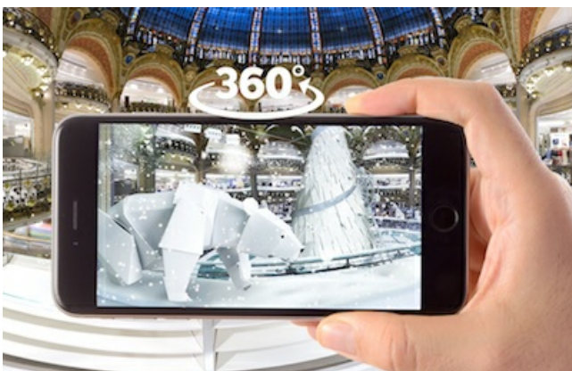
Galleries Lafayette's AR experience.

Galleries Lafayette wove the story of a family of polar bears who had to escape the North Pole as ice caps melted, eventually finding respite in the retailer's Parisian flagship. Completing the narrative in-store, Galleries Lafayette launched an augmented reality experience, which consumers could use to see the bears come to life in front of them ( see story ).