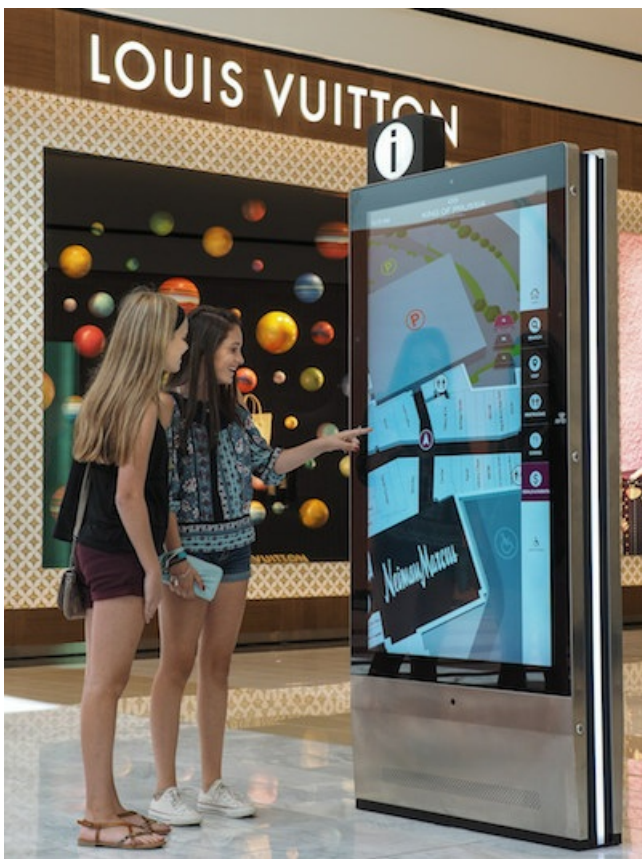
Digital directory at Simon's King of Prussia mall.

Simon similarly installed digital directories at nine of its upscale malls before the 2016 holiday rush. These interactive 65-inch LCD screens help shoppers navigate the malls, showing them the quickest route to take to get to a particular store and communicating with the user's mobile phone to provide on-the-go assistance ( see story ).