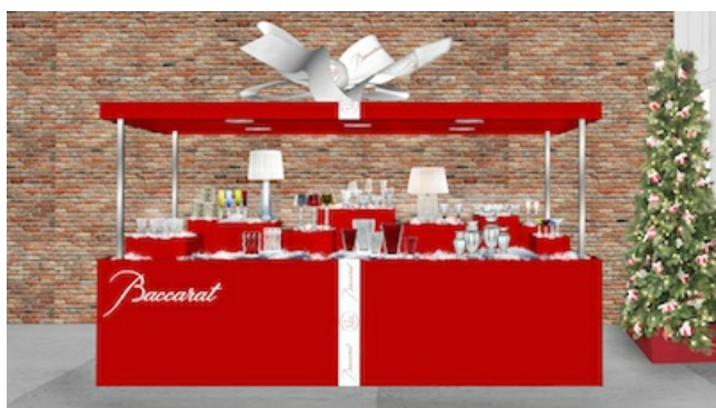
Rendering of Baccarat's pop-up.

The holidays have also proven a time for brands to experiment with pop-up shops. Last year, The RealReal opened its first bricks-and-mortar location, while Baccarat boosted its presence in New York with a temporary downtown location ( see story ).