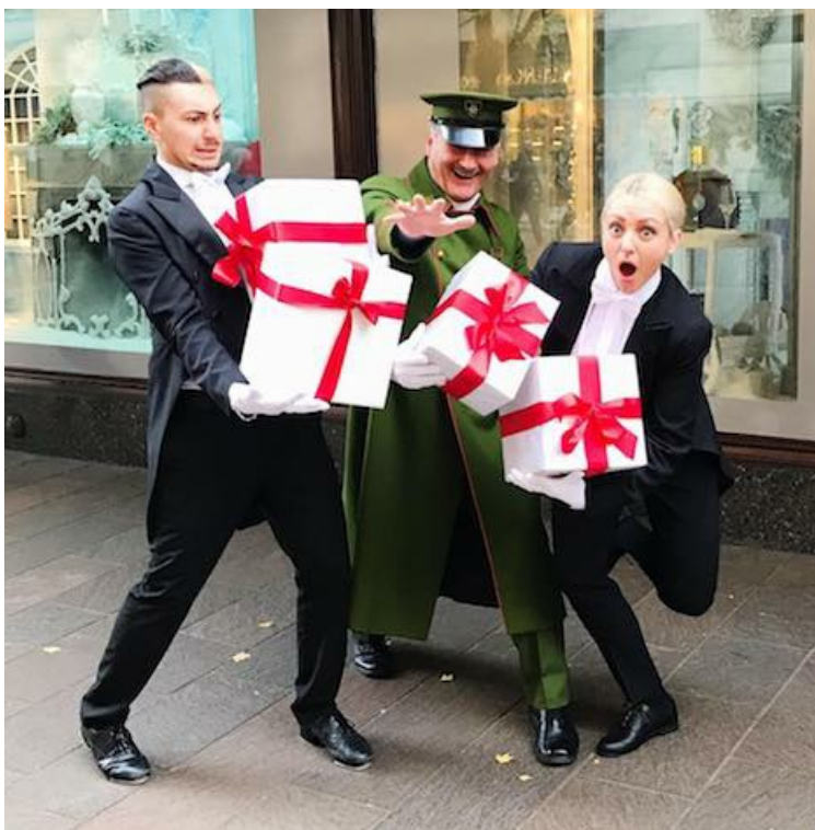
Harrods' post-holiday sale kicks off with an outdoor event.

LVMH-owned Sephora, for one, leveraged personalized in-application messaging to serve loyal customers end-of-year deals such as extra 20 percent-off discounts, prompting users to pamper themselves with gifts they did not receive for the holidays ( see story ).