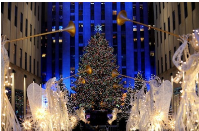
The Rockefeller Christmas tree in 2015.

A number of brands, including Valentino, have also outfitted Christmas trees in public spaces, with Swarovski gaining attention as the creator of the tree topper for the Rockefeller Center tree in New York.