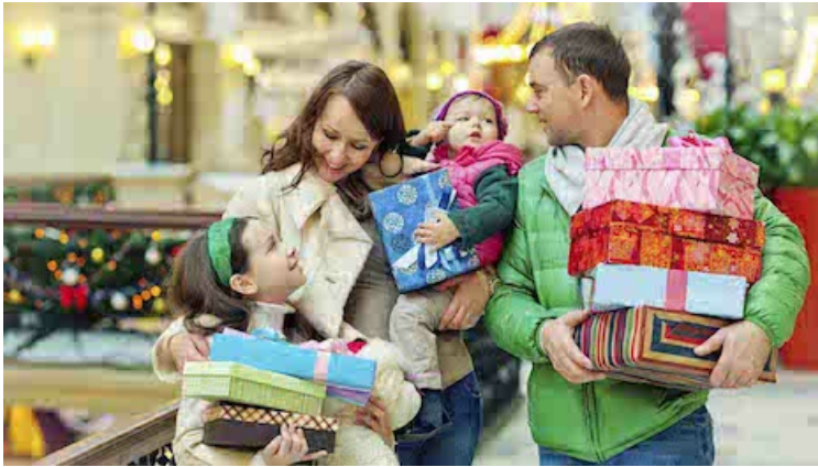
Holiday shoppers in New York

During the 2015 Christmas season, Mandarin Oriental Hyde Park, London had placement in Harrods' window display, while the hotel served a taste of Harrods with a themed afternoon tea. Holidays are often a time of camaraderie between luxury establishments, giving them more of an opportunity to make a magical and memorable experience for consumers ( see story ).