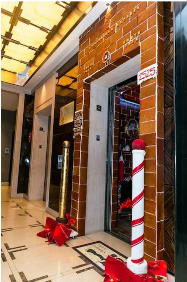
Gingerbread Express.

The Ritz-Carlton Hotels similarly built gingerbread houses at properties across the United States in 2015 to envelop patrons in the Christmas spirit ( see story ).