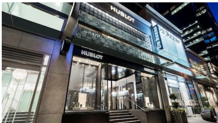
Hublot's boutique in Vancouver. Image courtesy of Hublot