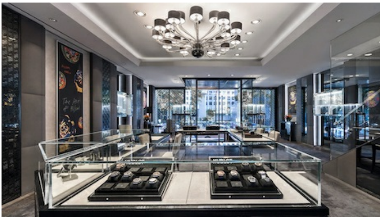
Inside Hublot's Vancouver store.

"Our boutique is in great company in the luxurious shopping district on Alberni Street and we look forward to developing in new Canadian cities very soon," he said.