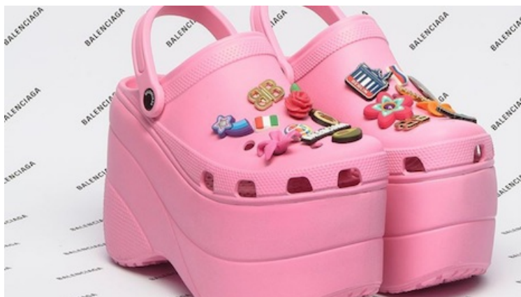
Balenciaga Crocs for spring 2018 in pink.