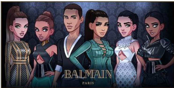
Balmain for Kim Kardashian Hollywood.

Drawing off Balmain creative director Olivier Rousteing's friendship with reality television celebrity Kim Kardashian, the French label made appearances in her mobile game. Players could dress avatars in Balmain runway looks and also see Mr. Rousteing in animated form as they played ( see story ).