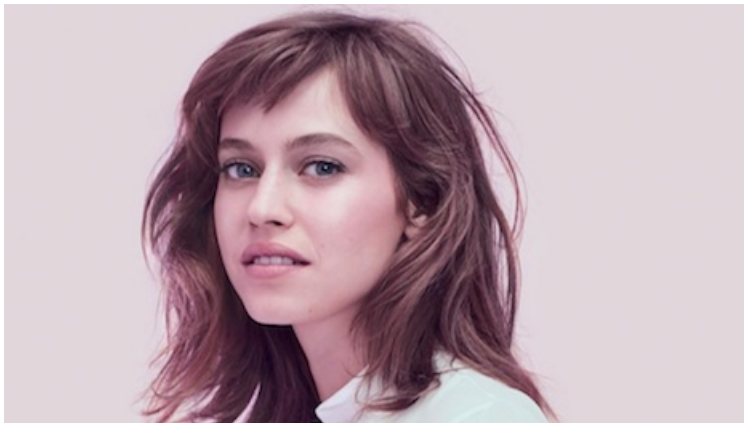
Lou de Lage's debut Insistible campaign will debut in 2018.