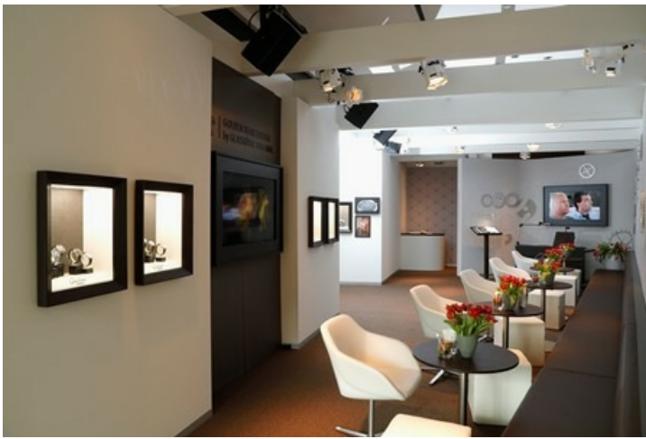
The Golden Bear Lounge by Glashtte Original at the Berlin International Film Festival in 2017.

For instance, Jaeger-LeCoultre's "The Art of Behind the Scenes" exhibit has been on view in Cannes, New York and Los Angeles to align with industry events. The display, curated by Finch & Partners, features photographs that captured the making of some iconic films ( see story ).