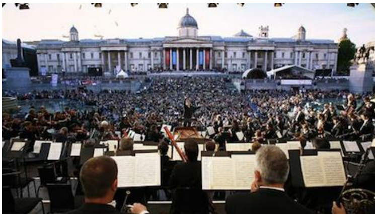
BMW LSO Open Air Classics in 2017.

Embracing a different genre, BMW has worked with symphonies in London, Munich and Berlin to bring live classical music to audiences for free. The London concerts have drawn out a considerable crowd of first-time symphony attendees and those under the age of 35 ( see story ).