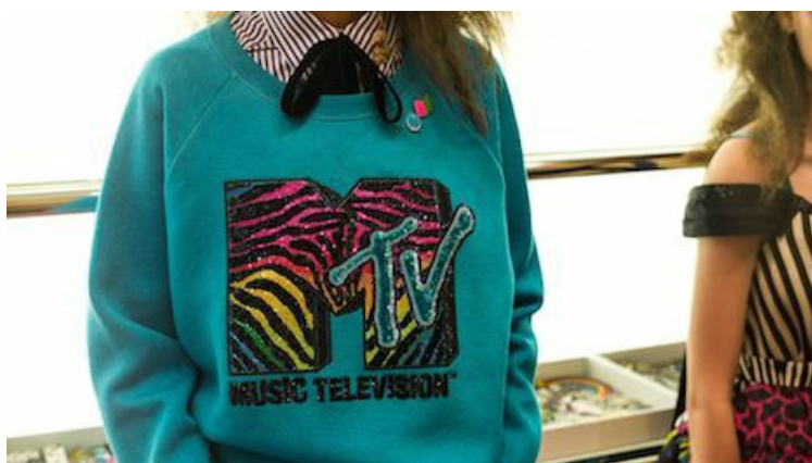
Marc Jacobs resort 2017 collection.

Marc Jacobs likewise paid homage to 1980s MTV with a capsule collection that launched before the television networks' Video Music Awards last year ( see story ).