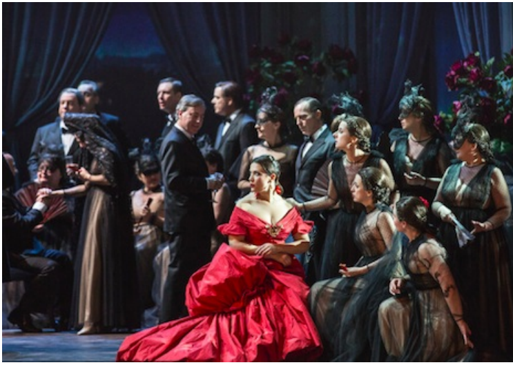
The costumes for "La Traviata" were designed by Valentino.

Dance and fashion have a symbiotic relationship, with designers appearing on-stage and performers starring in marketing efforts.