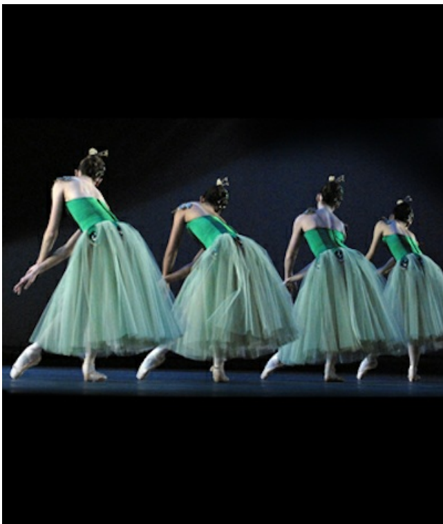
Emerald section of George Balanchine's "Jewels" ballet.

Van Cleef & Arpels' gems have served as the inspiration for choreographers George Balanchine and Benjamin Millepied, who translated the concept of the precious stones into dance.