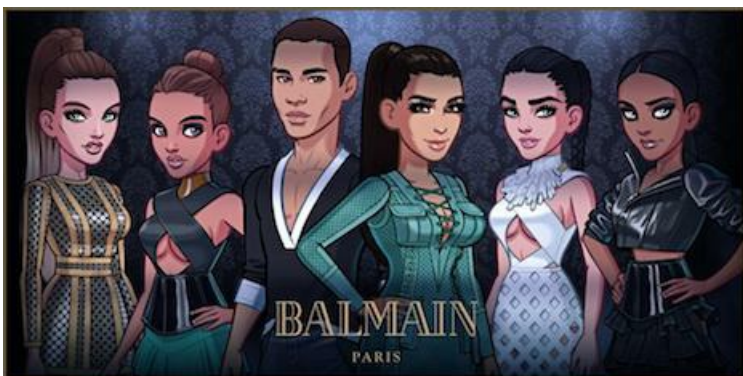
Balmain for Kim Kardashian Hollywood.

Drawing off Balmain creative director Olivier Rousteing's friendship with reality television celebrity Kim Kardashian, the French label made appearances in her mobile game. Players could dress avatars in Balmain runway looks and also see Mr. Rousteing in animated form as they played ( see story ).