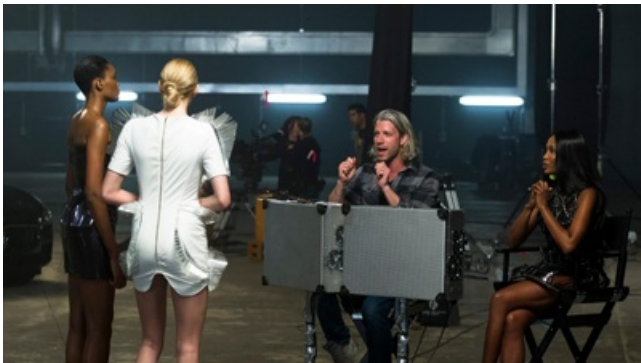
Maserati on "The Face."

For instance, an episode of the modeling competition show "The Face" featured a challenge revolving around Maserati's Quattroporte, wherein contestants were asked to create a commercial for the car. Unlike the fleeting nature of product placements that can stay invisible to consumers, structuring an entire episode around a product likely creates a greater impact ( see story ).