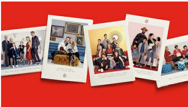
Portraits from "Love, Nordstrom" holiday 2017 campaign.

"Customers increasingly want to shop where, how and when they choose and 24/7 Curbside Pickup is one service we're offering to support their experience," she said.