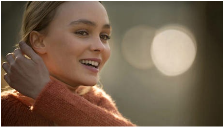
Portrait of Lily-Rose Depp by Valrie Donzelli for 2017 Rvlations project. Image credit: CsarAcademy

In 2015, Chanel extended its relationship with New York-based Tribeca Enterprises, the organizer of the annual Tribeca Film Festival, to support women in film.