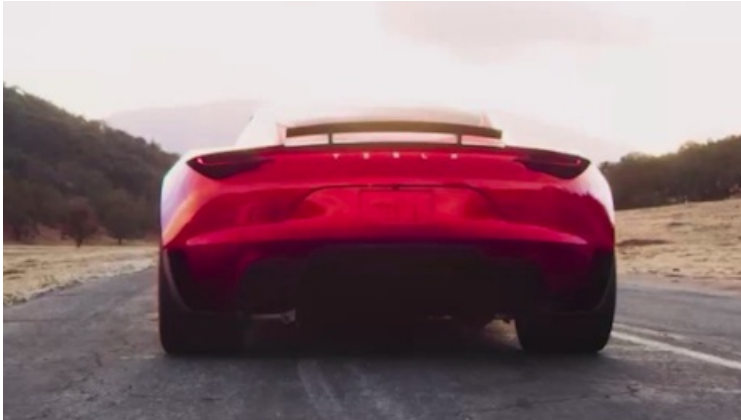
Tesla Roadster.