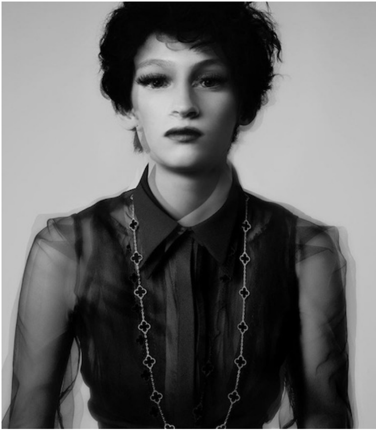
Gaspard Yurkievich dress paired with Van Cleef & Arpels' Vintage Alhambra necklace.