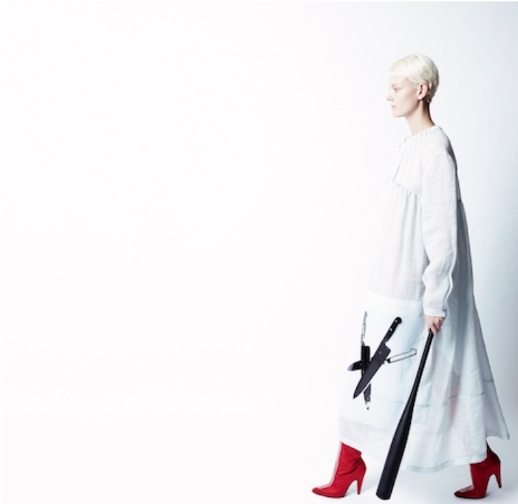
Calvin Klein 205W39NYC spring 2018, dress featuring Andy Warhol's "Knives."

Since taking the helm of Calvin Klein after stepping down at Dior, Mr. Simons has been exploring Americana from an outsider's perspective ( see story ).