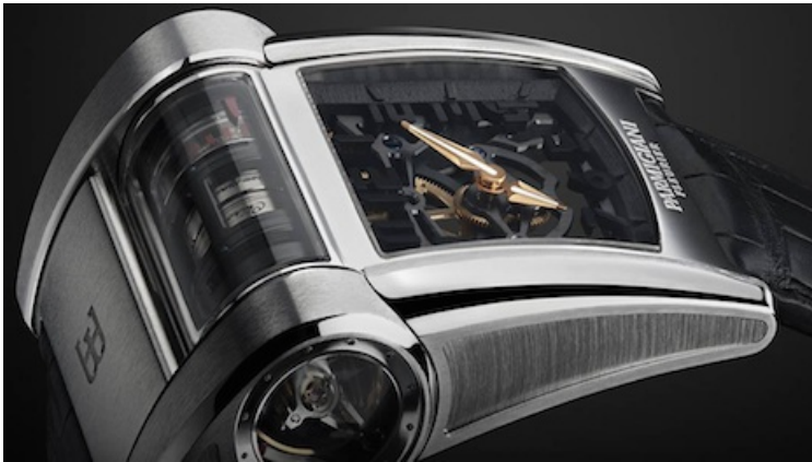
The Bugatti Type 390 is modeled after the Bugatti Chiron.

Bugatti's Chiron is the latest supercar from the auto manufacturer and comes with an impressive list of specs. Parmigiani is hoping to capture the attention of some of Bugatti's enthusiastic customers by releasing a commemorative watch that is meant to act as a companion to the car itself ( see story ).