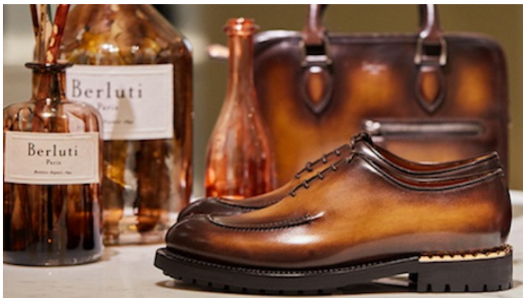
Berluti's Women's Capsule Collection

This trend does not exist solely for fashion, it extends to retail as well.