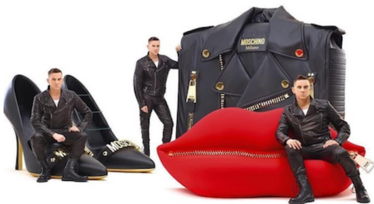
Moschino x Gufram limited-edition furniture collection.

Another common option is to take a classic design and update it for a modern look.