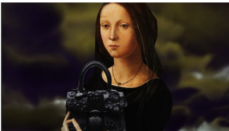
Still from Nic Courdy's animation featuring Delvaux's Black Beauty handbag.

In addition to fine art, popular culture can also serve as an inspiration for luxury designs, such as the HBO television series "Game of Thrones" did for Delvaux.