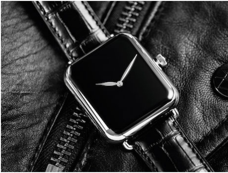
The Swiss Alp Watch Zzzz.

Apple's event on Sept. 12 showed that the consumer electronics maker is continuing to be a threat to luxury, with both a new ultra-premium model of iPhone and the announcement that Apple Watch has surpassed Rolex as the most popular timepiece in the world.