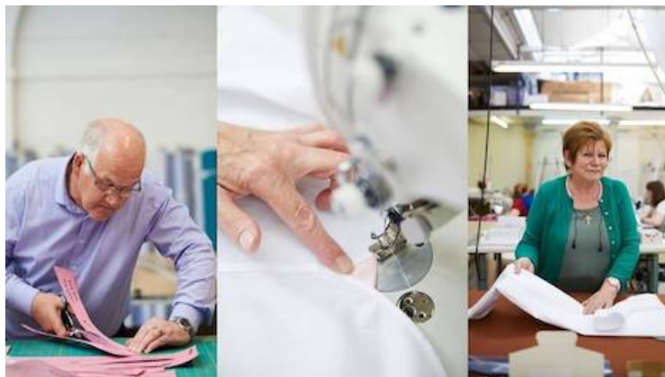
Thomas Pink's "Meet the Shirtmakers" campaign.

Similarly, British fashion house Thomas Pink took consumers inside the workshop where its shirts are made in a second short video.