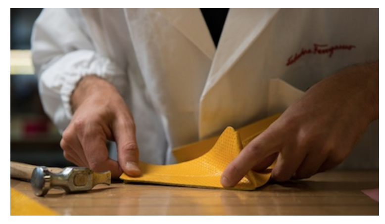
Ferragamo has opened a design hub for leather goods.