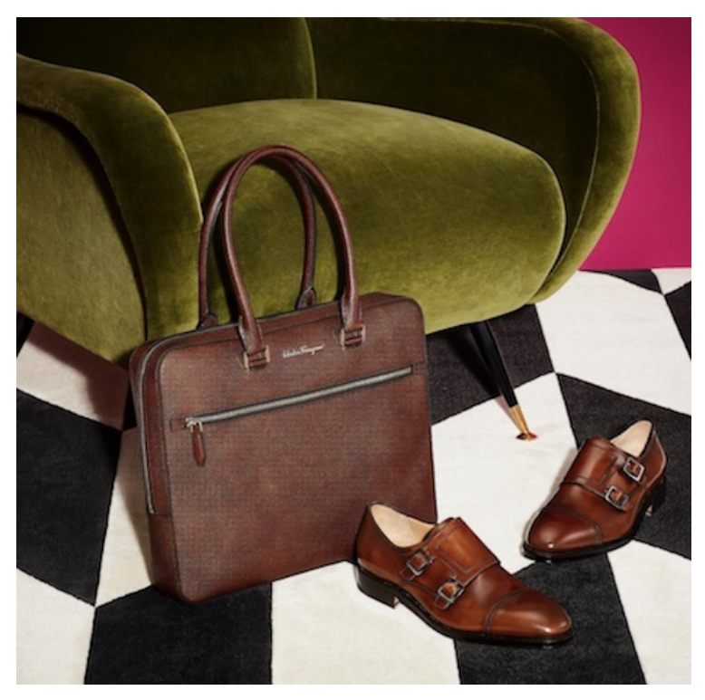
Ferragamo men's leather goods for fall/winter 2017.

Ferragamo's Osmannoro space is part of a larger redevelopment project in the neighborhood.