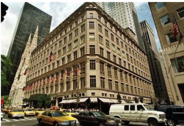
Exterior of Saks Fifth Avenue flagship.

Saks Fifth Avenue's parent company Hudson's Bay Company faced an activist investor that was urging it to sell real estate assets to boost its stock performance. Among its many banners, HBC owns a number of pricey properties, including the Saks flagship on New York's Fifth Avenue.