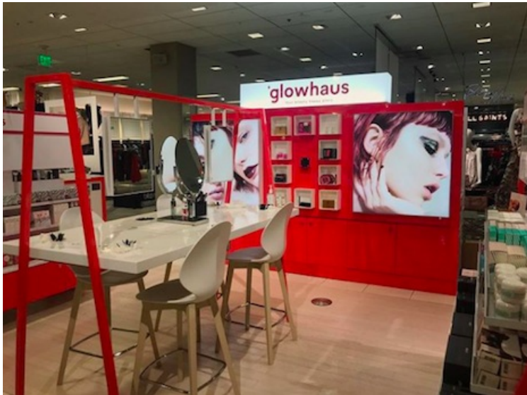
Glowhaus in Bloomingdale's at South Coast Plaza.