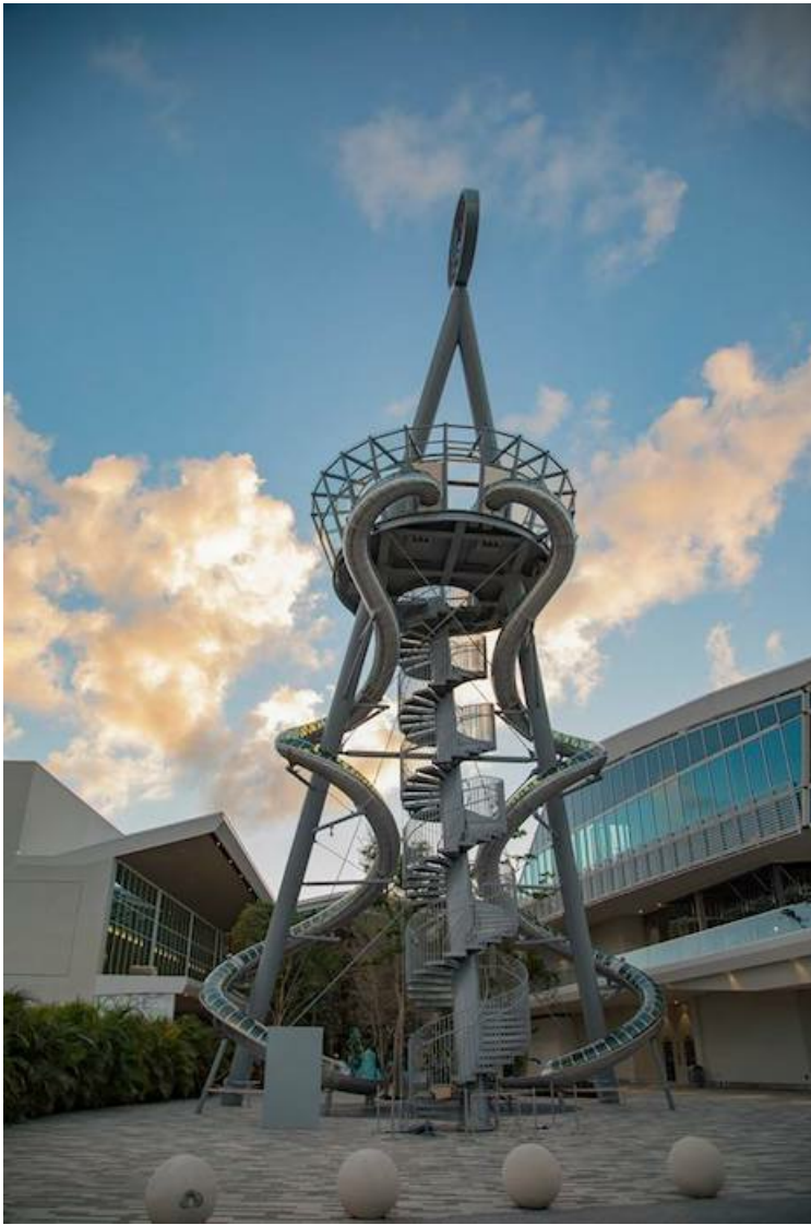
Aventura Mall's slide tower.

Department store chains remain the chosen anchors for new developments, as well. Neiman Marcus was the first store to open in the newly constructed Shops at Clearfork in Fort Worth, TX ( see story ).