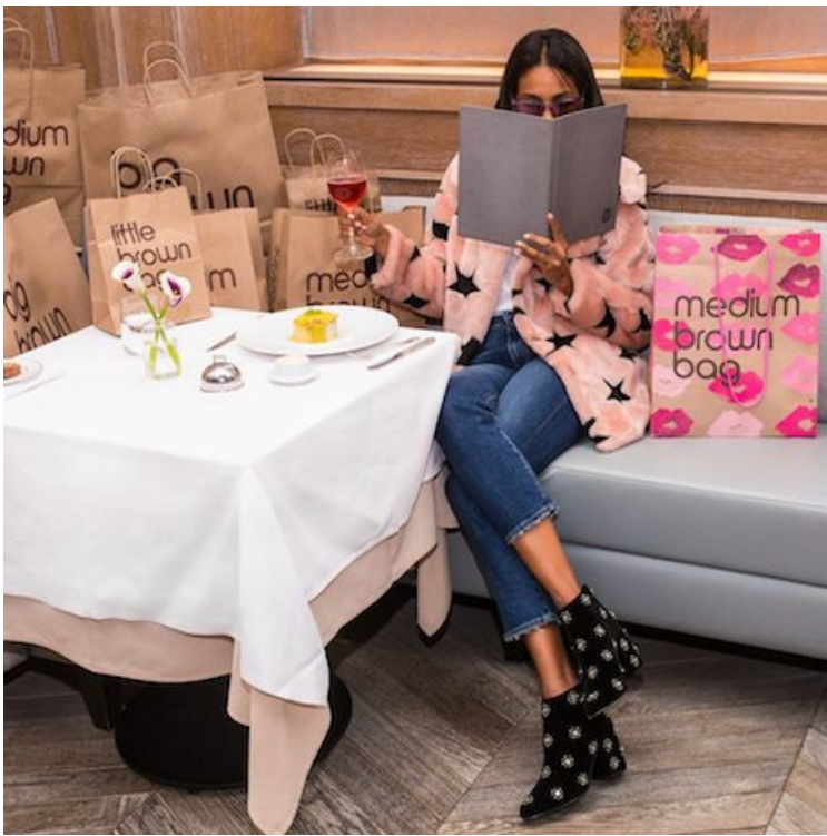
Retail now has to compete with experience for wallet share.