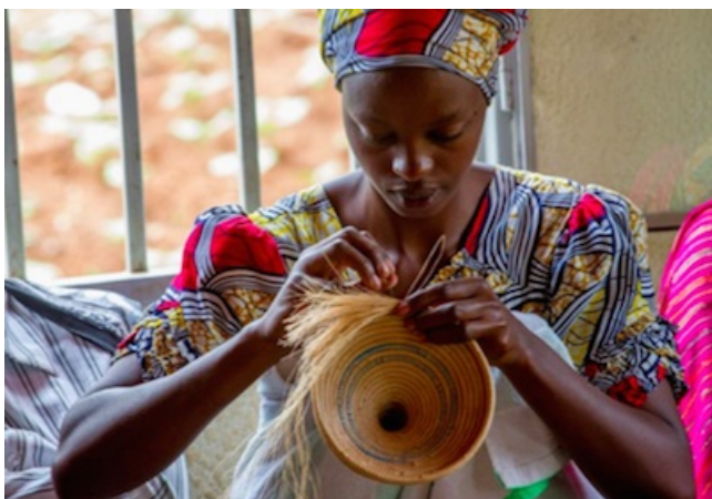
Holt Renfrew's H Project supports artisans.

With fur a no-go for many consumers, in June Yoox Net-A-Porter Group made a commitment to be fur-free, ceasing the sale of fur on all of its multi-brand sites ( see story ).