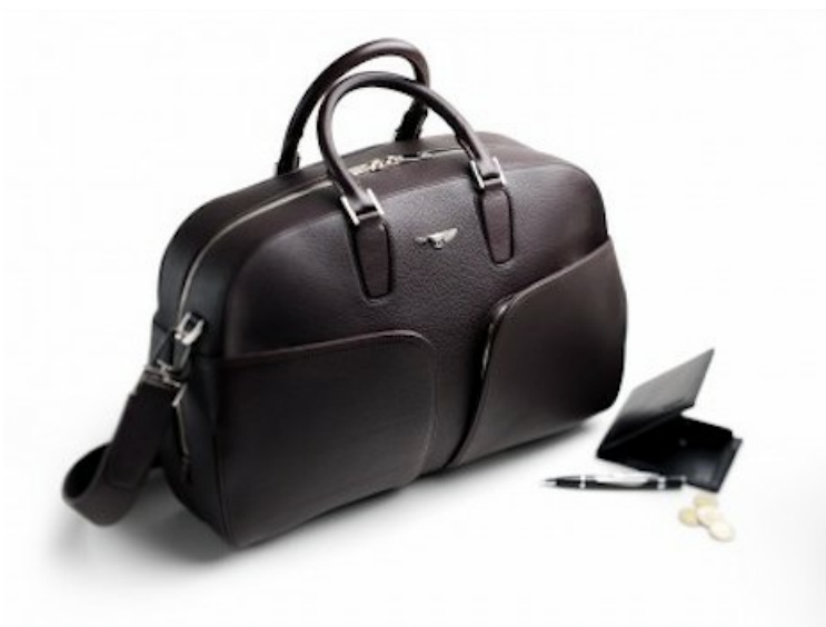
An example of Bentley Motors' leather goods.

Also, the strategy positions shared lifestyle associations and an appreciation of fine quality as a loyalty signifier.