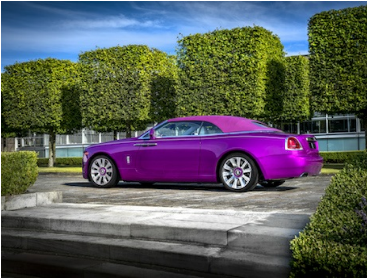
Rolls-Royce's bespoke Dawn in Fuxia for Michael Fux.

Bespoke capabilities start and stop with a client's request, and Rolls-Royce is happy to work with its consumers to meet their expectations and make dreams a reality.