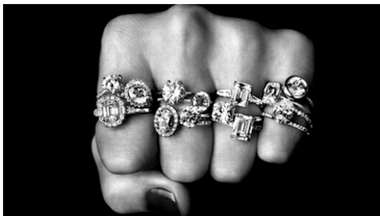
Lab-grown diamonds are in a position to disrupt the luxury jewelry sector.

Click here to see the sector's top headlines