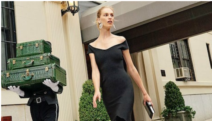
Packing it up for 2017.