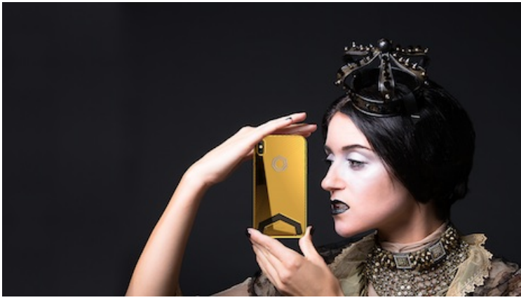
Brikk's iPhone X plays into the phone's luxury target.