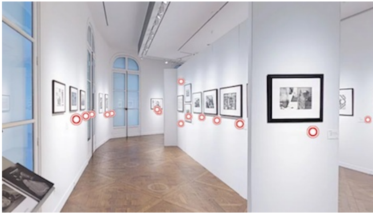
Christie's VR walkthrough in its saleroom.

Click here to see the sector's top headlines