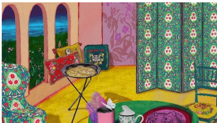
Gucci Decor brings the house's codes into the home. Image courtesy of Gucci, illustration by Alex Merly

Click here to see the sector's top headlines