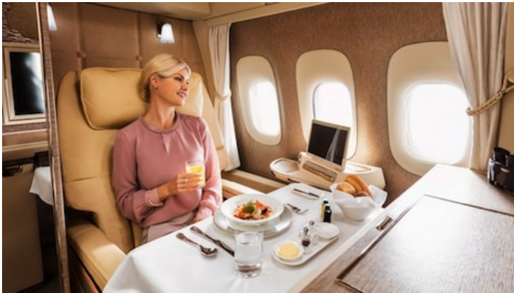
Emirates takes inspiration from Mercedes for its in flight suites.

Click here to see the sector's top headlines