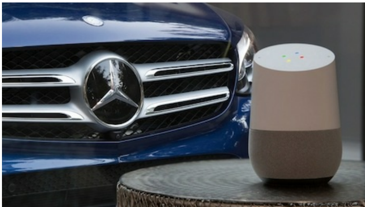
Mercedes-Benz has previously partnered with Google Home

Click here to see the sector's top headlines