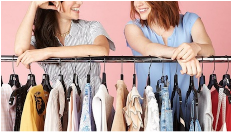
Retail has faced disruption.