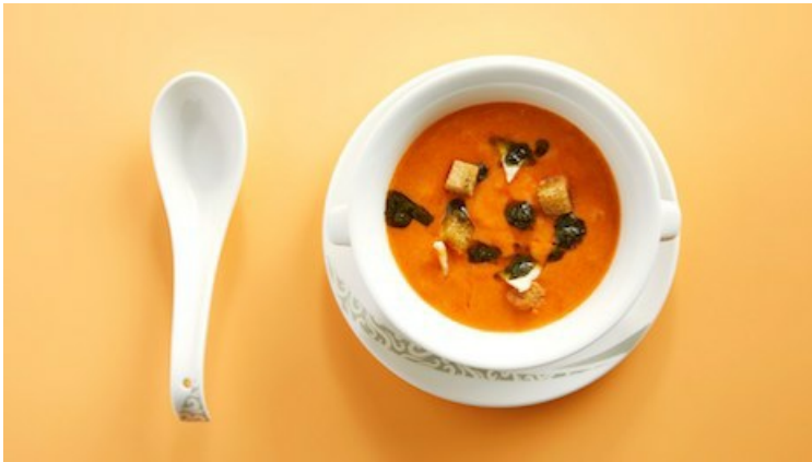
Ritz-Carlton Beijing and Air China teamed for a 4-course Italian meal.

Click here to see the sector's top headlines