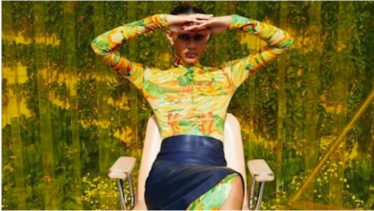
Cline's spring/summer 2018 campaign.