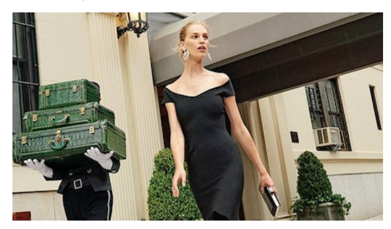
Packing it up for 2017.