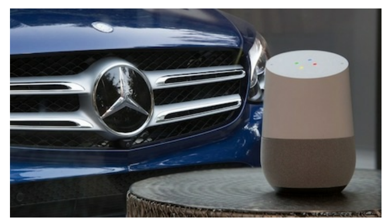
Mercedes-Benz has previously partnered with Google Home