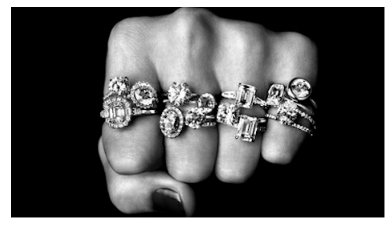
Lab-grown diamonds are in a position to disrupt the luxury jewelry sector.