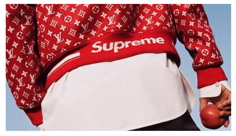
Louis Vuitton x Supreme collection.

Please see below for Luxury Daily's top headlines from 2017, by sector: