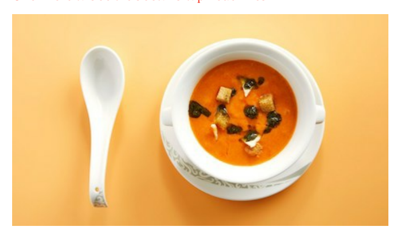
Ritz-Carlton Beijing and Air China teamed for a 4-course Italian meal.