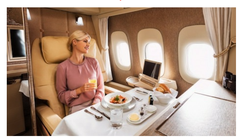
Emirates takes inspiration from Mercedes for its in flight suites.