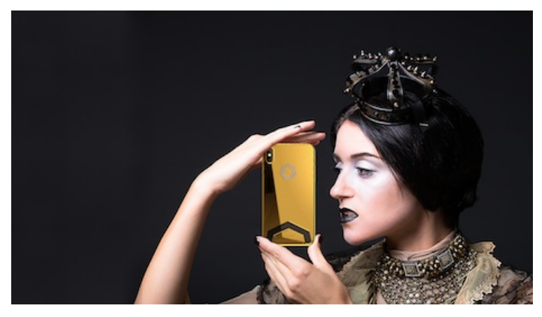
Brikk's iPhone X plays into the phone's luxury target.