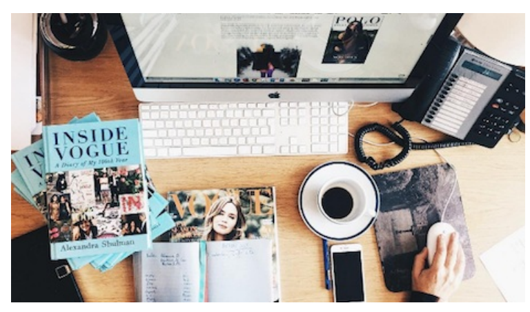
Most Vogue readers follow the title and its editors on social media