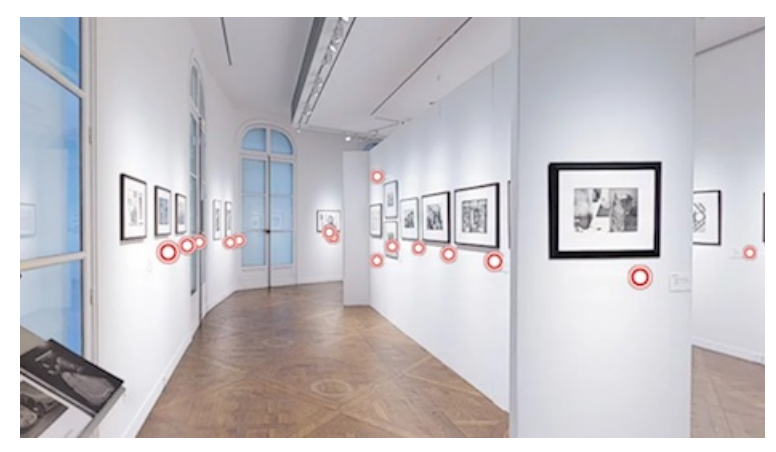
Christie's VR walkthrough in its saleroom.