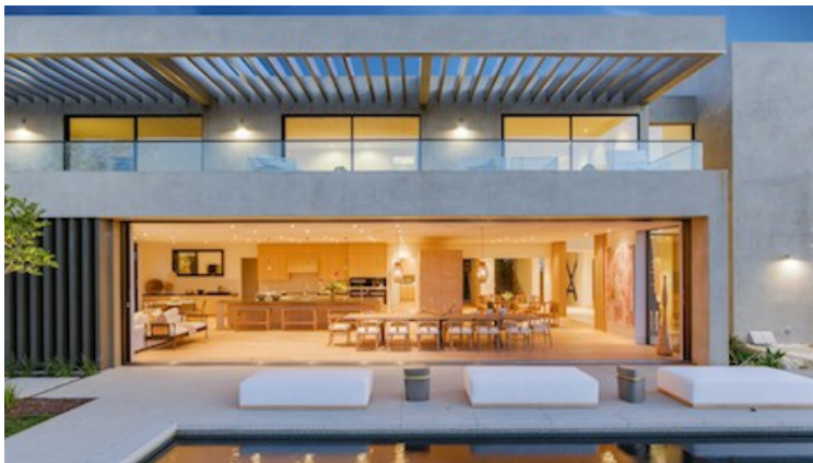
Teles Properties listing in Los Angeles.

Click here to see the sector's top headlines