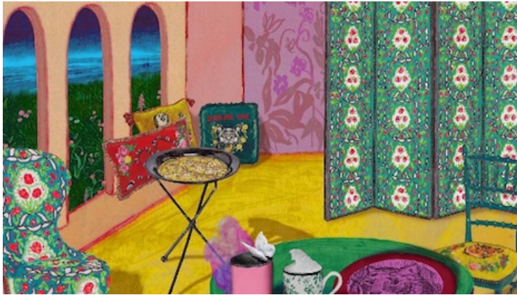
Gucci Decor brings the house's codes into the home. Image courtesy of Gucci, illustration by Alex Mery

Click here to see the sector's top headlines