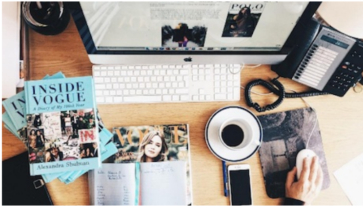
Most Vogue readers follow the title and its editors on social media

Click here to see the sector's top headlines