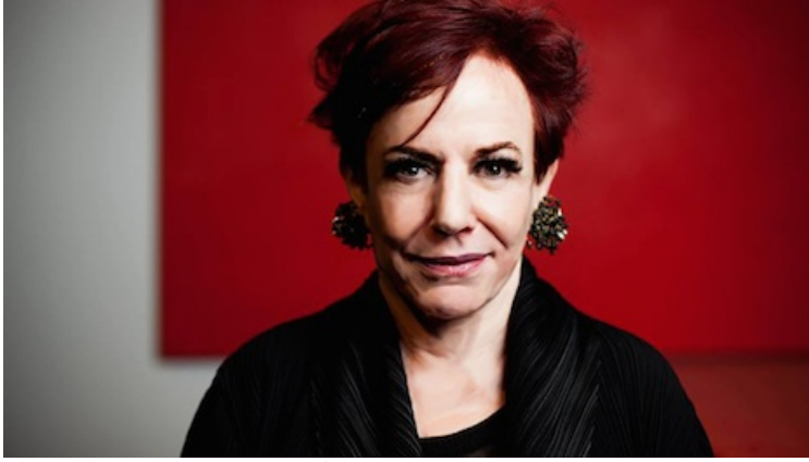
Faith Popcom is a futurist and CEO of FaithPopcom's BrainReserve