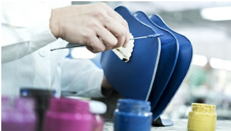
A Furla handbag being worked on at Effeuno.