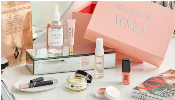
Birchbox x Vogue, a limited-edition box for the magazine's 125th anniversary

Subscription-based companies such as Birchbox have provided a space for luxury beauty brands to offer trials to consumers in hopes of a return engagement with the brand.