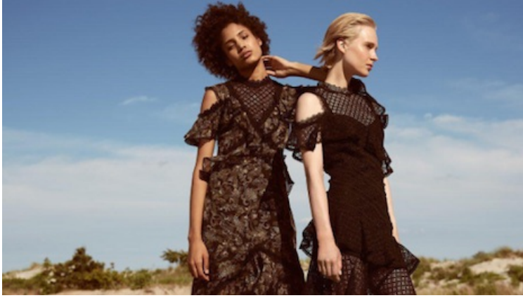
Rent the Runway and other disruptors are changing the fashion game.

Rent The Runway was among the first mainstream apparel-sharing services, opening up its virtual shop 12 years after Netflix in 2009. It offers women the chance to have a different dress or purse for every occasion without breaking the bank.