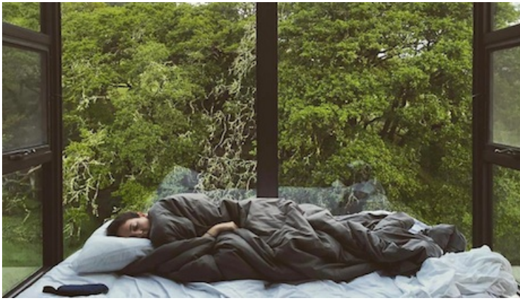
Airbnb listing in Bennett Valley, California

Airbnb has created a style of accommodation to which many modern travelers are becoming accustomed. While the company did struggle in the beginning stages, similar to how any other outlandish new idea usually fares, the founders took a look at how their customers were using their product to discover how to push forward.