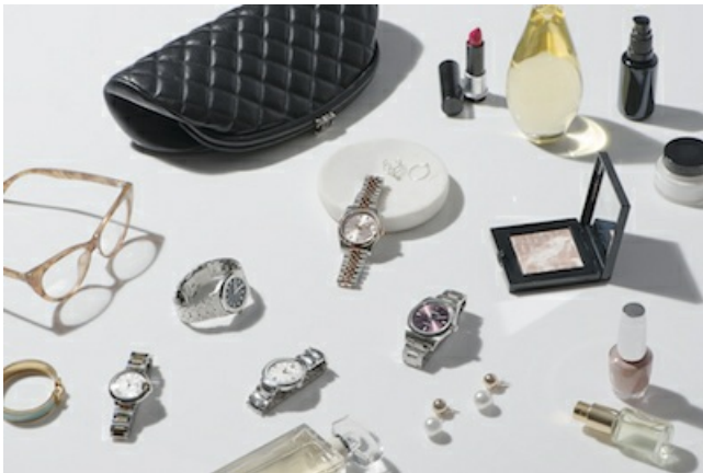
Eleven James women's collection

The desire for millennials to own luxury items is often still a dream for the younger working professionals, but the chance to dabble with luxury through the sharing market makes the dream a temporary reality.