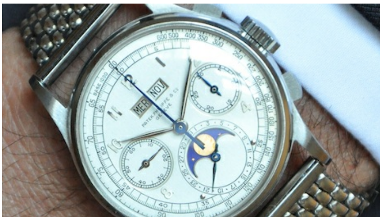
Patek Philippe's record-breaking reference 1518 watch

The nature of this industry is counterintuitive to the core values of the many luxury brands that focus on heritage and passing heirlooms through familial generations.