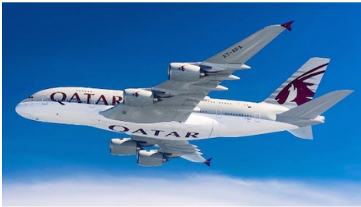
Qatar Airways plane 465

Similarly, Qatar Airways bet it big on business class reinventing the cabin with double beds in its Boeing 777 and A350 planes. Qatar's risk is unprecedented in the world of its competitors, such as Etihad or Emirates, where the focus on first class is still prevalent.