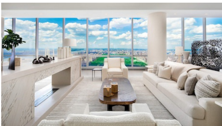
One57 condo Sotheby's Realty 465

According to the Douglas Elliman 2017 Manhattan Townhouse Decade Sales Report , from 2008 to 2017 negotiability became more flexible in New York luxury real estate, resulting in a decline in on-the-market time. The average sales price in the past 10 years in luxury was reported as $20,382,189.