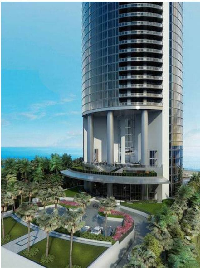
Porsche Design Tower Miami

Russian consumers are likely interested in Miami properties due to the stability of the U.S. dollar. Local currencies within Russia are currently weaker, providing Russians with confidence regarding U.S. real estate investments.