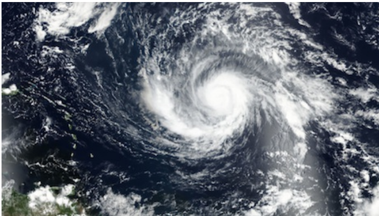
Hurricane Irma moves through the Caribbean.

Trends have been seen in those looking to purchase in South Florida or Hawaii who previously were seeking property in the Caribbean. Similarly, there has been an influx of renters in South Florida from Puerto Rico and other islands badly hurt in the summer's storms.