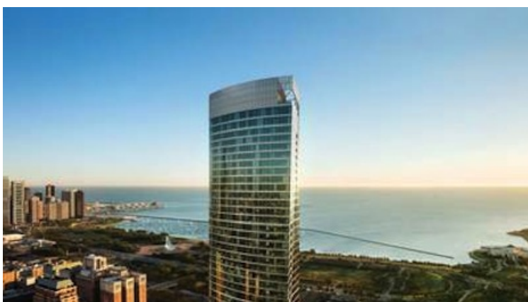
Chicago's 1000M is located on one of the city's most iconic streets

Records are also being broken in terms of the physical buildings that are home to some of the world's most renowned real estate offerings. A variety of luxury real estate firms and developers are appealing to affluent clientele through unique buildings that become part of famous city skylines on iconic streets.