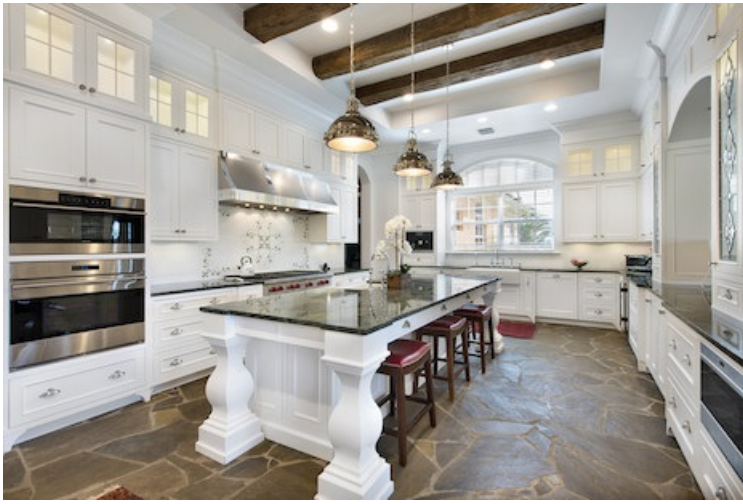
Platinum Luxury Auctions - Boca Raton - Kitchen

Trends can create a disruption or boost in the real estate industry, but often the future is unpredictable.