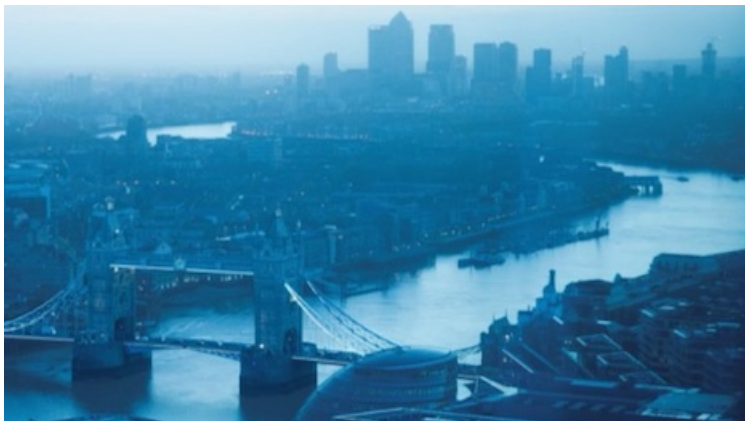
London; image courtesy of Burberry

Surprisingly to many, real estate is one area in the chaos caused by Brexit where things are actually looking up.