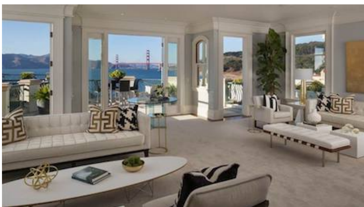
San Francisco property

In 2017, California cities saw a decline in the luxury real estate market. While in the recent past the luxury real estate market was plagued by an overabundance of listings, on-the-market properties in California priced for more than $1 million saw a 23.8 percent drop. Residences priced more than $5 million also saw a decrease in listings by 23.4 percent with prices rising by 13.7 percent.