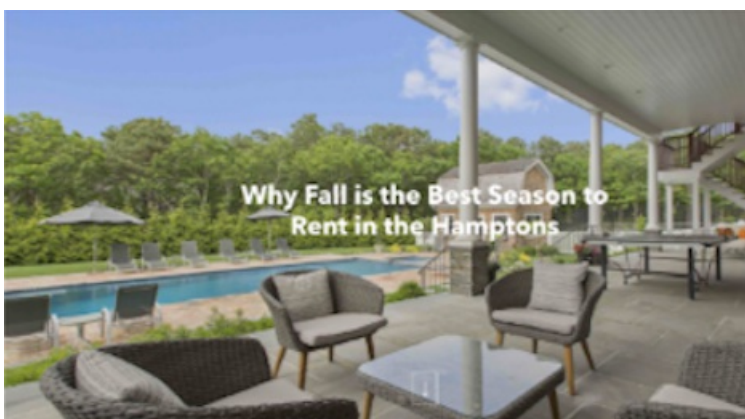
Douglas Elliman's online blog

The project will allow potential buyers to tour virtual homes and experiment with interior decoration all through the power of virtual reality. As VR has become increasingly accessible, powerful and usable, more brands and companies in the luxury world have begun experimenting with its unique capabilities ( see story ).