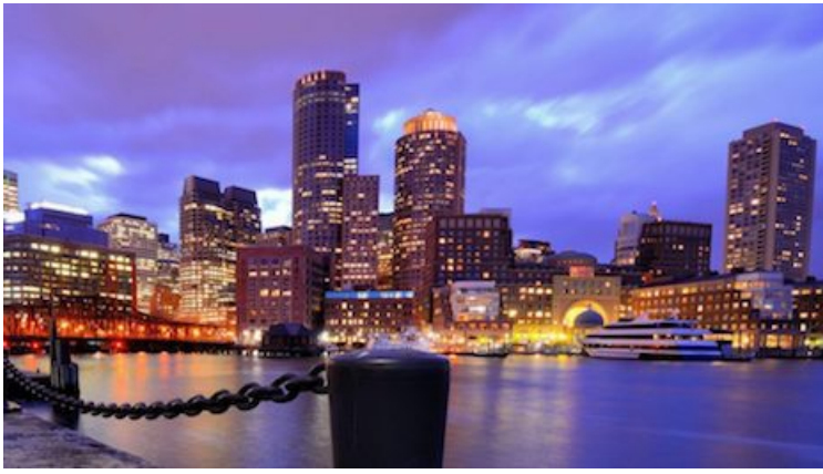
Boston is a popular location for Chinese homebuyers in the US

Chinese consumers are the number one foreign buyer in the U.S. for real estate, with $31.7 billion spent from the segment over the past year. According to real estate network Zillow, the U.S. construction market will start to focus on entry-level homes as well as luxury to cater to the Chinese segment.